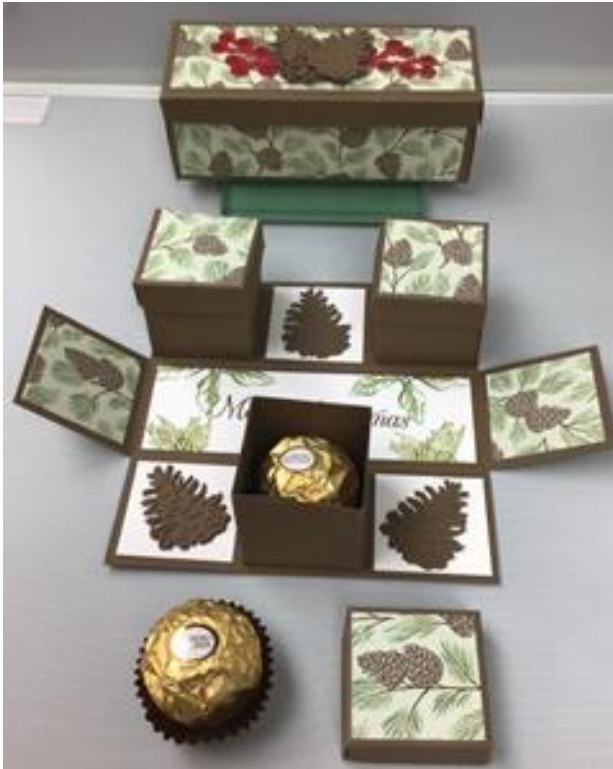
Finished size approx. 2 x 5-1/4

I love this box found from Nellie's site. The only problem I had was getting the inside box lids to stay intact when you open it all up. I tried cutting a smidgeon off the lid measurements, but that almost made them too tight.